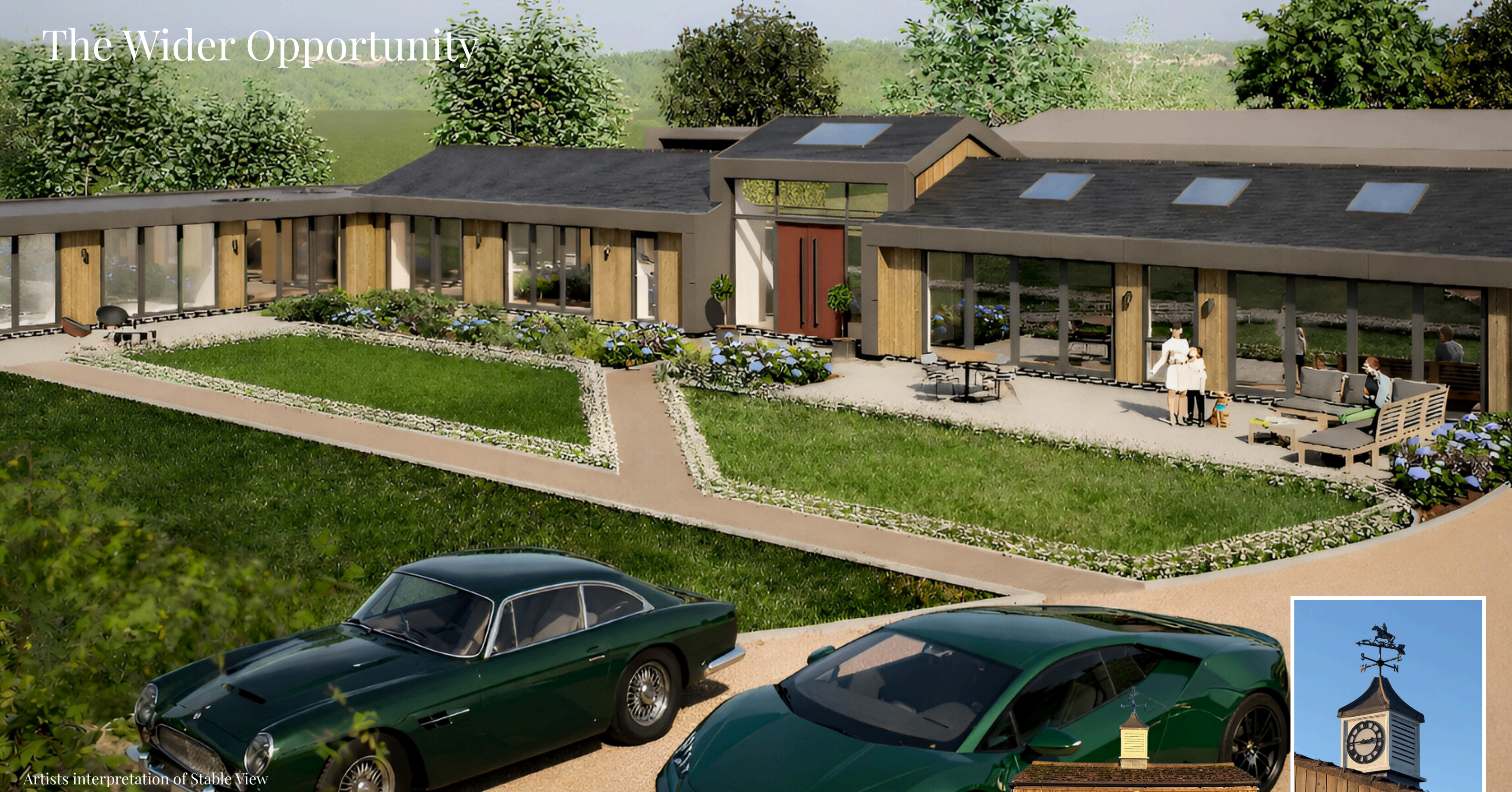
Artists interpretation of Stable View

Adjacent to Elmslodge Farm is an exceptional opportunity to extend the estate further. The adjoining land benefits from planning permission for two one bedroom annexe style holiday lets, offering clear potential for guest accommodation or income generation.